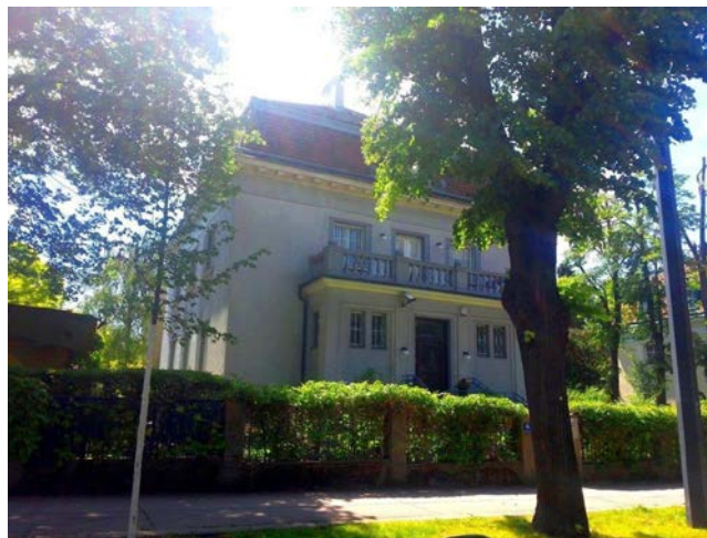
The Twin House

We are delighted that we can fill this house again with thirst for knowledge and creativity in the old tradition of the place. We are happy to welcome you here in Vienna for the 6 th ERIA meeting 2015.