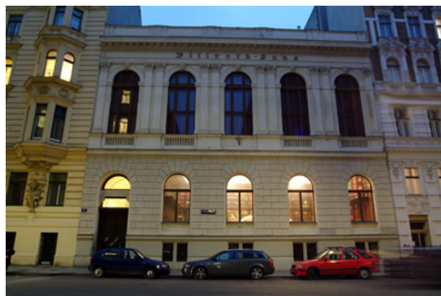
The Billroth House