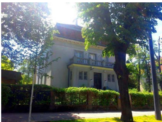
The Twin House

We are happy to welcome you here in Vienna for the 7 th ERIA Meeting 2016.